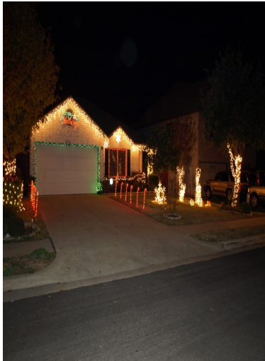
Get ready to decorate the neighborhood for the season.